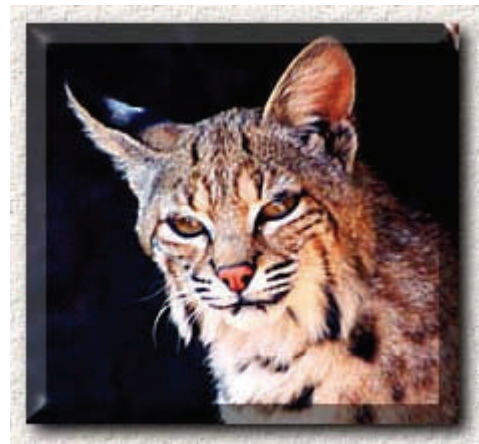
The Bobcat, Felis rufus